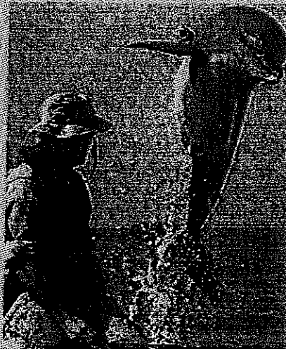
K-Dog, a bottlenose dolphin, has a camera attached to its flipper to record underwater objects. 2003.

This dolphin is helping soldiers. How? It looks for hidden objects on the ocean floor. Other animals help people too. Jump inside to learn all about them!